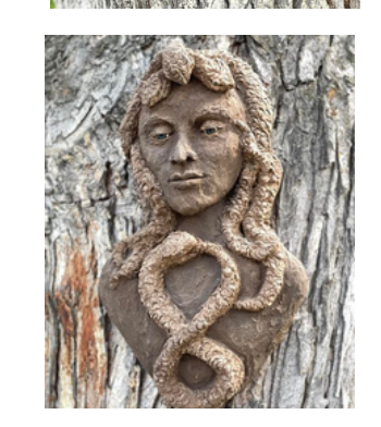
"How Did That Turn Out" is hanging out on the south of Main keeping an eye on the neighborhood.

"Guardian" finds a lovely old Maple tree south of main to hang out.