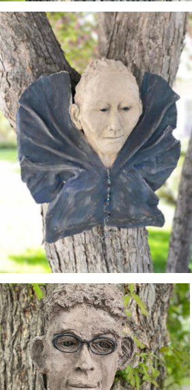
"Free to Be Me" has landed in a flowering Crab Apple tree on Hamilton's north of Main St

"Thundercloud" is resting quietly in a Maple tree south of Main St.