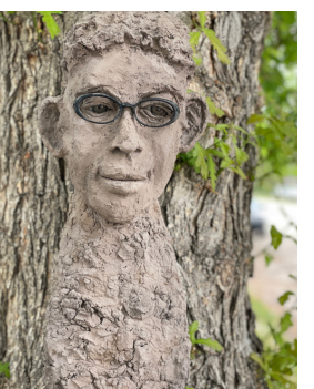
"Taking it Under Advisement" is hanging out on an Oak tree south of Main.