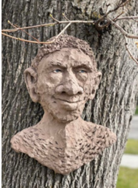
"Gar Today" is hanging out north of Main for all those enjoying walk abouts keep an eye out for him.